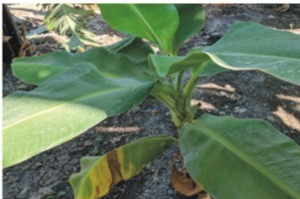
Control in Banana Sigatoka Leafspot, New shoots are spot free

Spray in morning or late evening for better results.