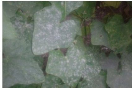
Before spraying Mycicon for Powdery Mildew