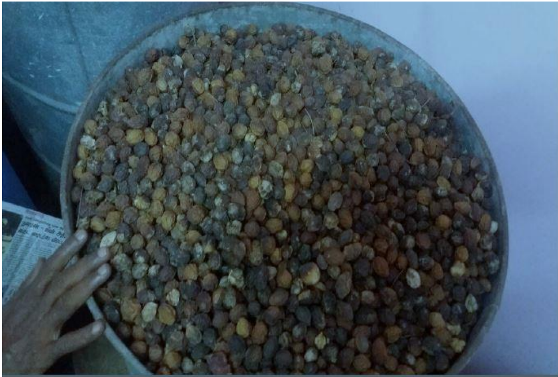
Natural Seed/Untreated – with outer layer