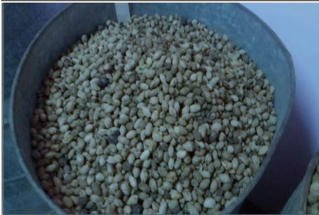
Artificial Seed /Treated seed – Without outer layer