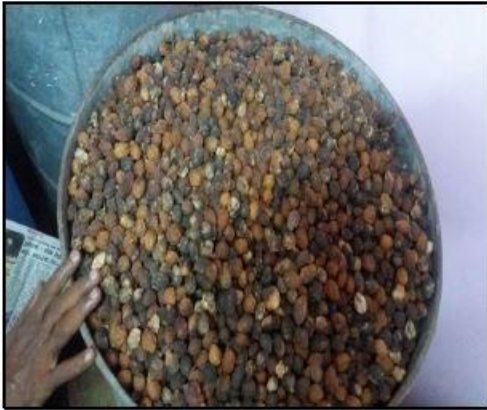
Natural Seed Germination : 40 %