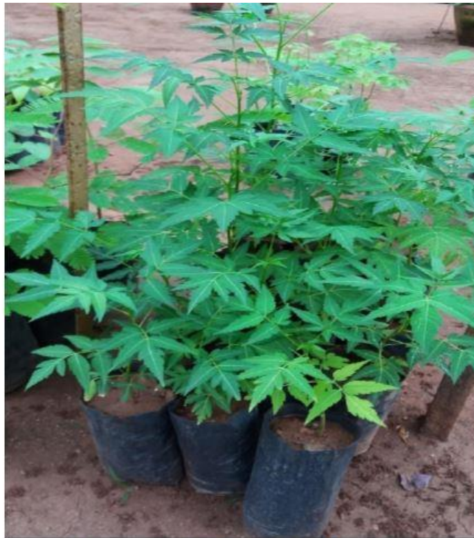
Prick out poly bags 2 months old seedlings