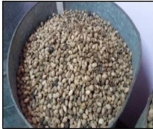
Artificial Seed Germination : 70 -80 %